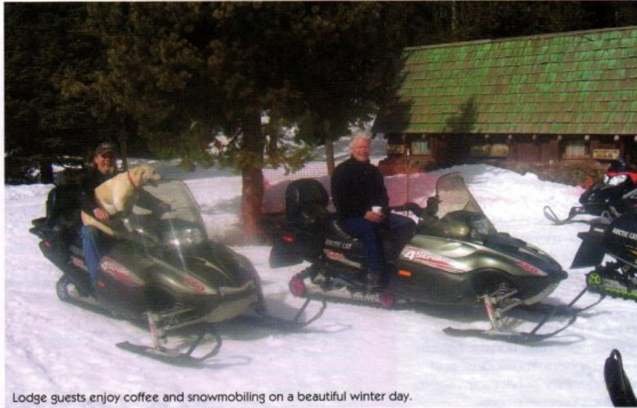
Lodge guests enjoy coffee and snowmobiling on a beautiful winter day.

Winter is a magical time of year, however, the season does not limit the appeal of Paulina Lake Lodge. Spring and summer supply plentiful fishing, hiking, camping and sightseeing excursions. Paulina Lake Lodge is open Thursday to Saturday for lunch and dinner and Sunday for lunch only. For reservations and detailed information on restaurant hours, shuttle and rentals call (541) 536-2240 or visit the website at www.paulinalakelodge.com . §