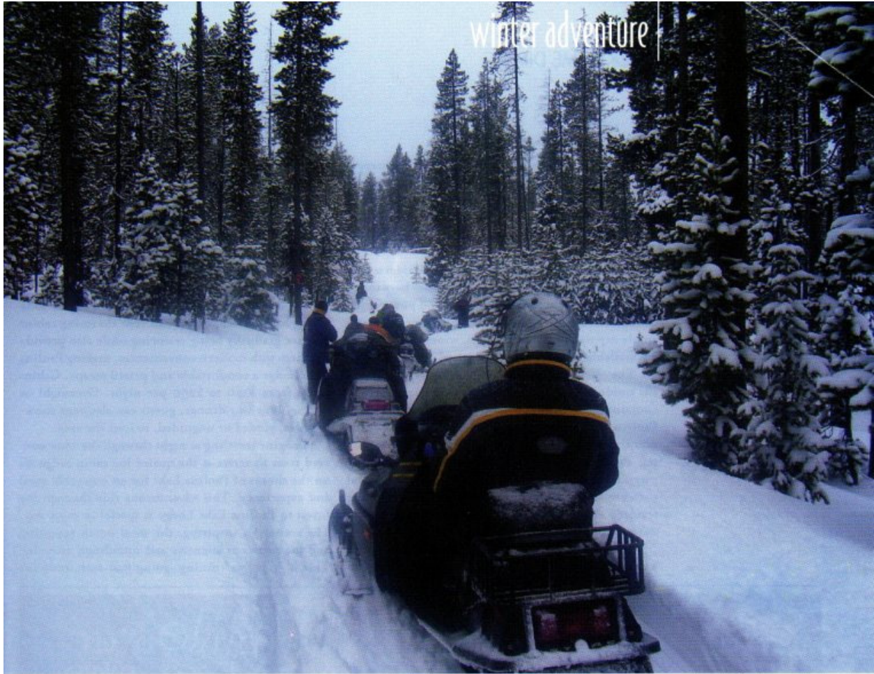
Snowmobiling in Paulina Lake.