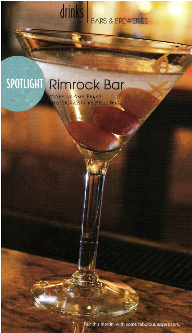
Pair this martini with some fabulous appetizers.

STORY BY AMY PEREZ